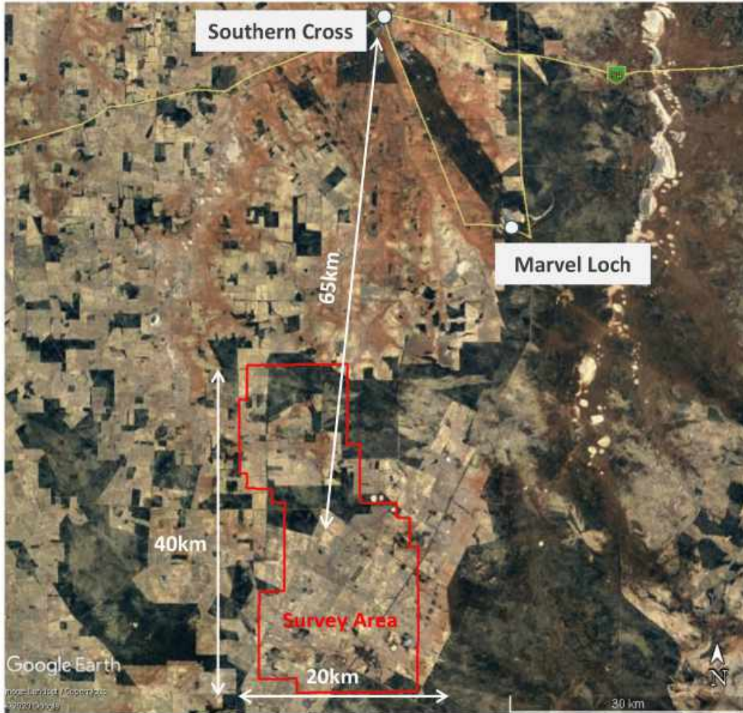
Figure 2 Survey location map