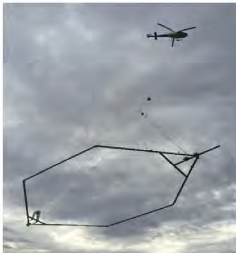
Figure 1: Picture of the AEM system from the ground.

The survey will be conducted in accordance with relevant state and national restrictions regarding Covid-19. No ground disturbance will occur within the survey area.