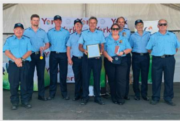
Photo: York Volunteer Fire and Emergency Services received the Active Citizenship Group / Event award for their continued efforts to keep the community safe.

It was a pleasure to join the community of York for their Australia Day and citizenship ceremony, celebrating the volunteers and community members who contribute to our towns and region. Congratulations to all that were recognised in their local awards!