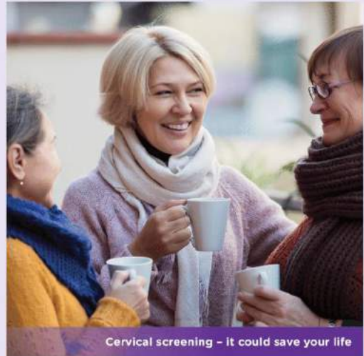
Cervical screening – it could save your life

© North Metropolitan Health Service 2024