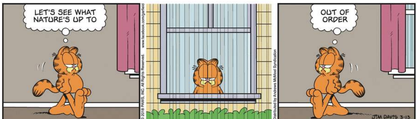
Garfield by Jim Davis